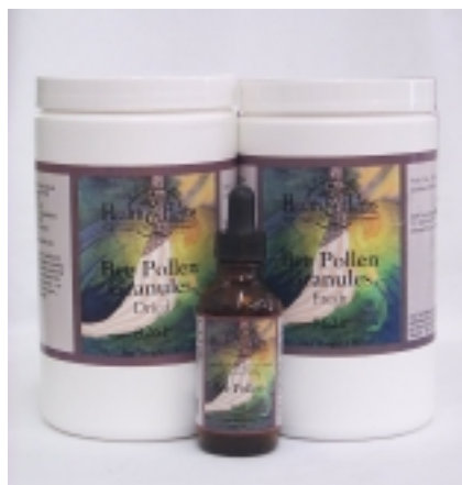
Bee Pollen granules and tincture page 7