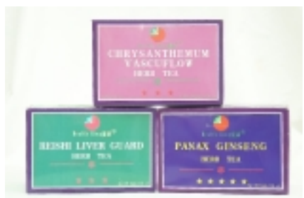
Health King Herb Teas page 6