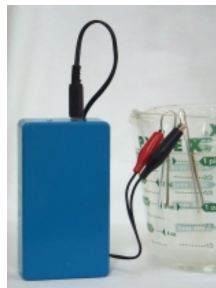
Silver generator in use page 11