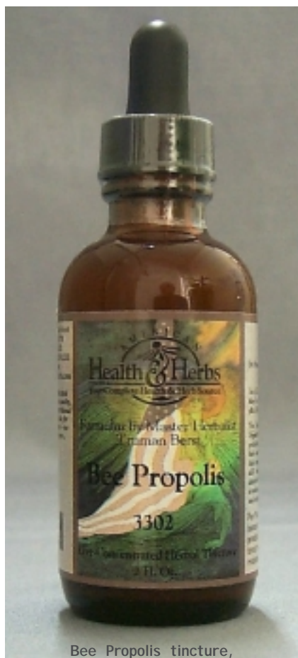
Bee Propolis tincture, page 21