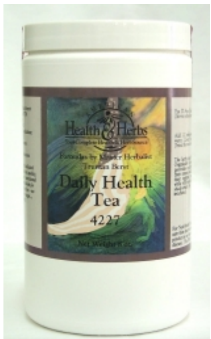
Daily Health Tea, page 6