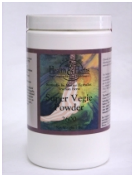
Super Veggie Powder page 6