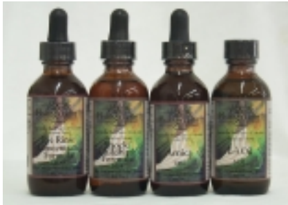
Herbal Emergency First Aid Kit page 13