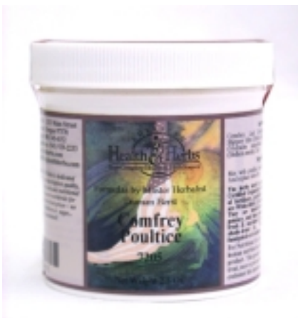
Comfrey Poultice, page 12