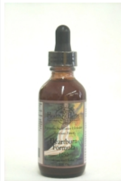
Heartburn Formula, page 18