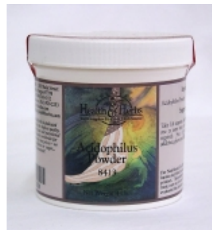
Acidophilus Powder (non dairy) page 9