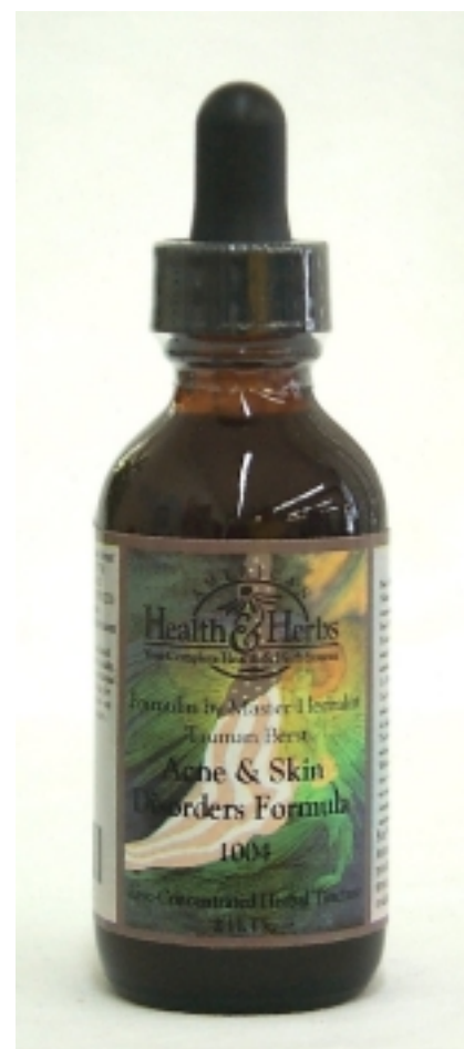
Acne & Skin Disorders Formula page 16

Breaks up plaque; sweetens breath; strengthens tooth enamel