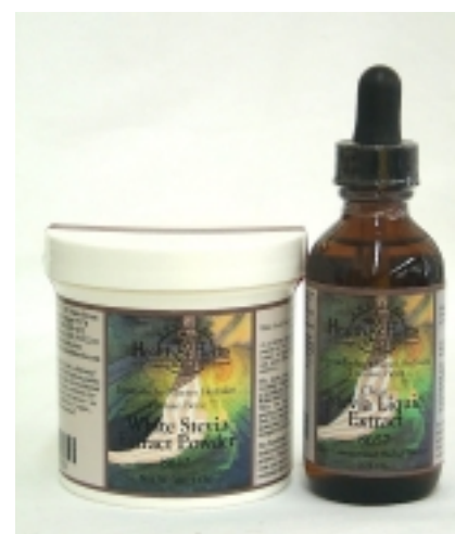
White Stevia Extract powder and tincture page 11