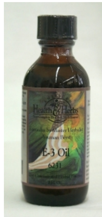
Truman's E-3 Oil, page 11