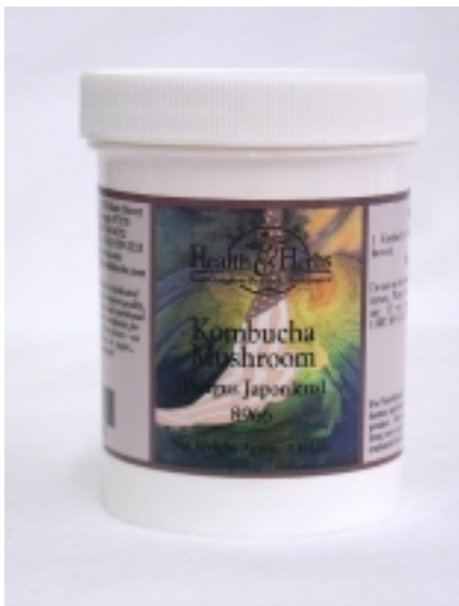
Kombucha Mushroom page 10