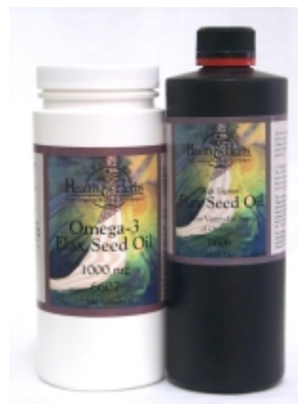
Flax Seed Oil (high lignan) -- capsules and liquid page 9