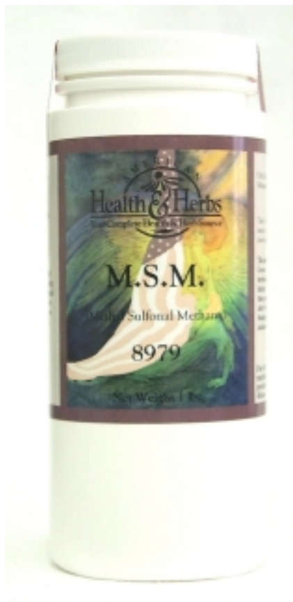
MSM -- ultrapure (methyl sulfonyl methane) page 10