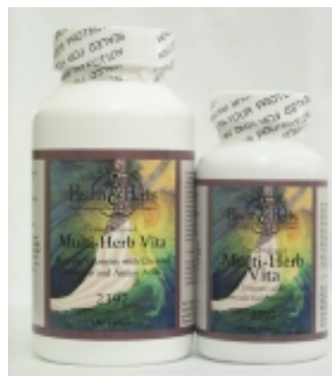
Multi-Herb Vita, page 8