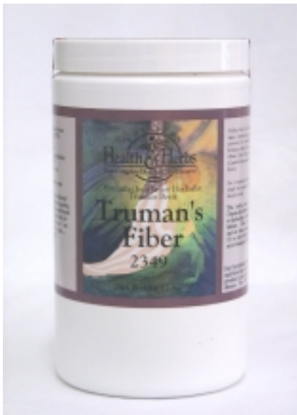
Truman's Fiber, page 5