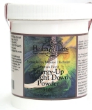
Energy up - Weight Down page 5

Kills intestinal parasites safely without chemicals.