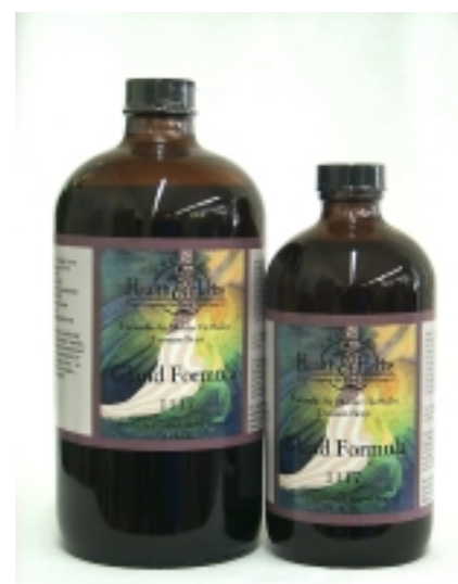
Gland Formula, pages 5 and 18