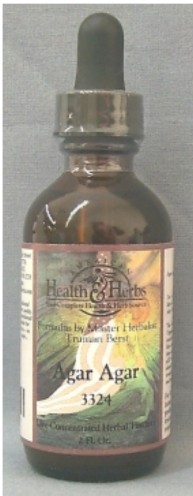
Agar Agar, page 21