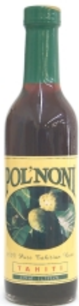
Noni page 10