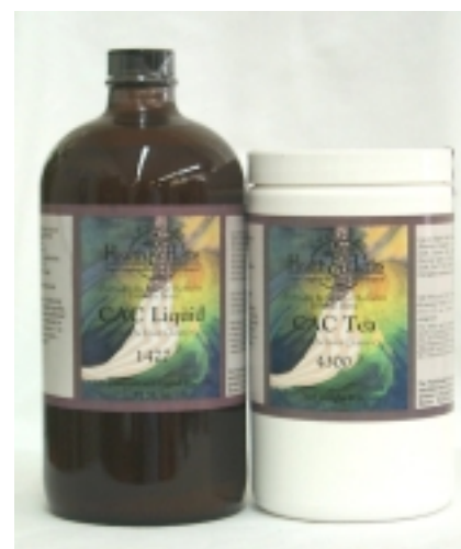
CAC Liquid and CAC Tea, pages 5 & 6