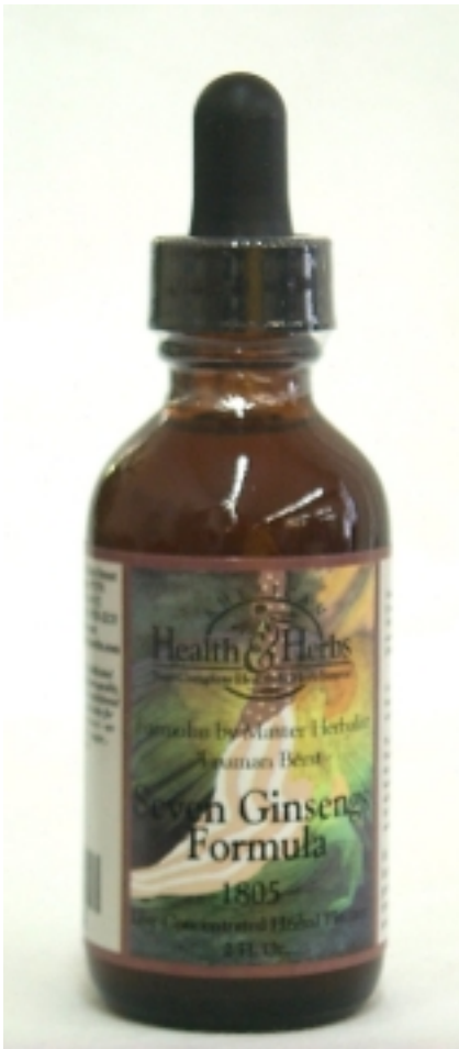
Seven Ginseng Formula, page 7 (2 oz tincture shown actual size)